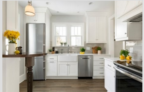
Adapted Article from Houzz.com

Finally, the whole kitchen was brightened up with a glossy gray backsplash, white marble-look quartz countertops and a bright apron-front sink. Stainless Steel appliances are built-in and blend in well with their surroundings. Clean, Crisp and Elegant!