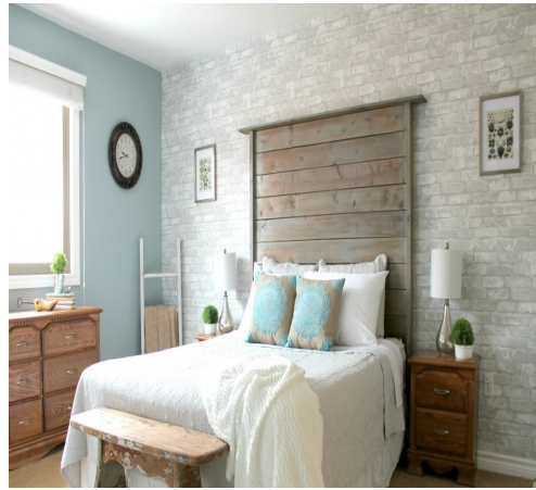
Adapted from Northern Nester